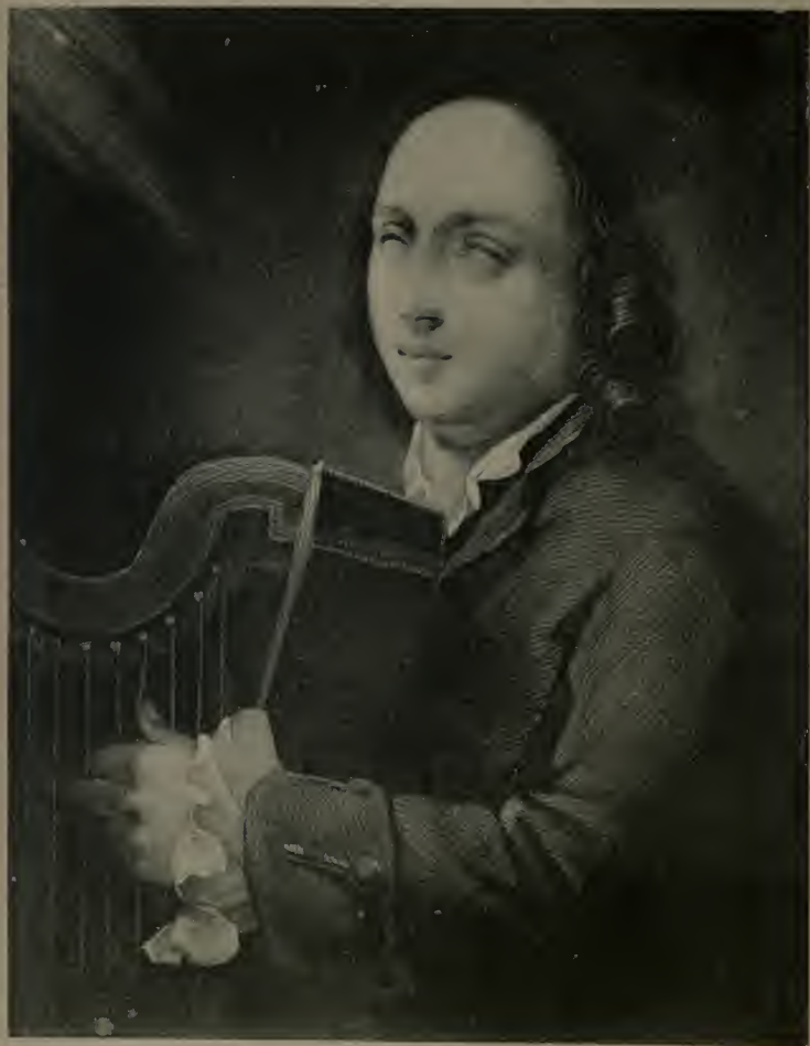
CAROLAN, THE IRISH BARD.